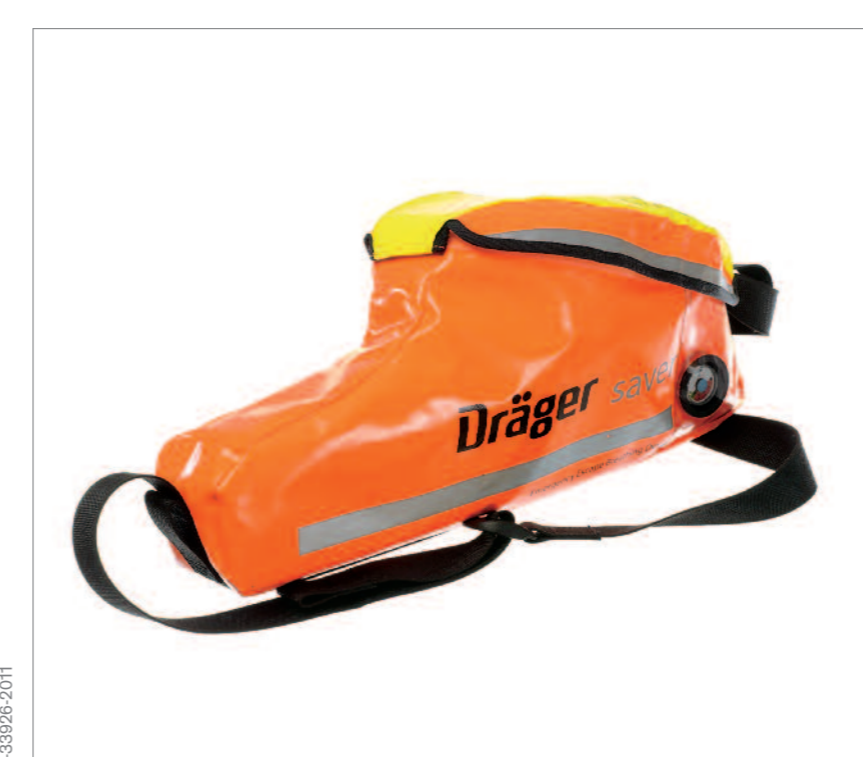
Dräger Saver PP Soft Bag