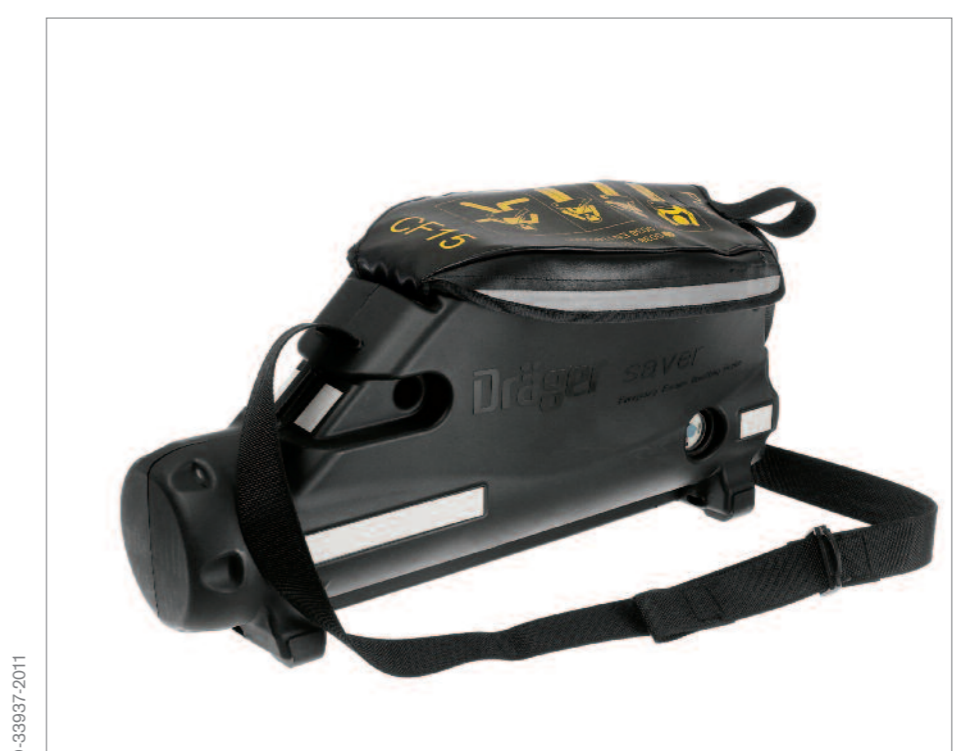
Dräger Saver CF Hard Case