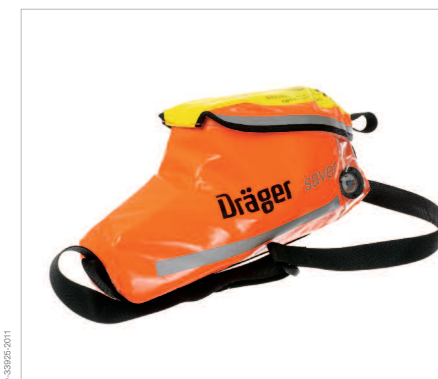
Dräger Saver CF Soft Bag