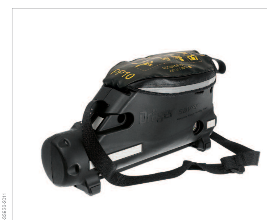
Dräger Saver PP Hard Case